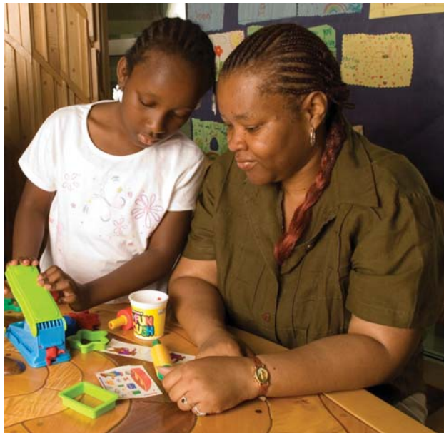
Mother and daughter (above) have greatly benefitted from Cleveland's MetroHealth Family Advocacy Program.

doing so, CAP intends to reach new populations by working with gerontologists on elder law issues and Spanish-speaking doctors to reach clients in the Hispanic community. Persons reentering society from prisons will also be targeted.